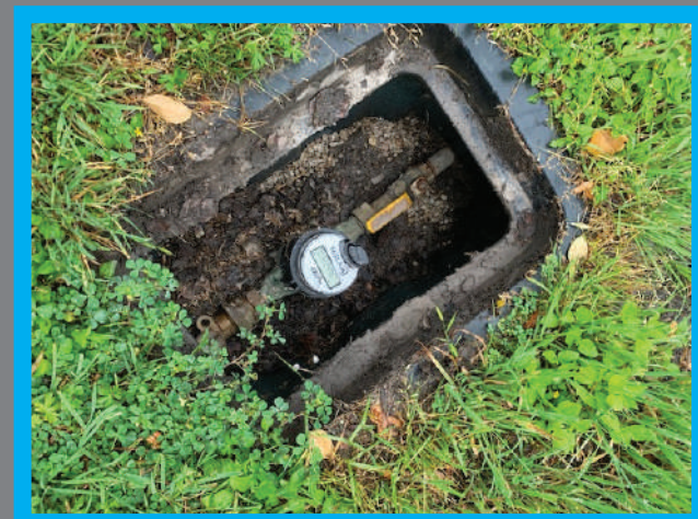
Figure B: meter and main shut off valve