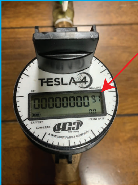
Standard DSWS Meter

It is important to make sure no water is being used inside (washing machine, showers, faucets etc.) nor any irrigation outside your home during your meter examination. Locate your water meter within a black hard plastic box, see both Figures A and B. If your digital counter is actively increasing, you probably have a leak.