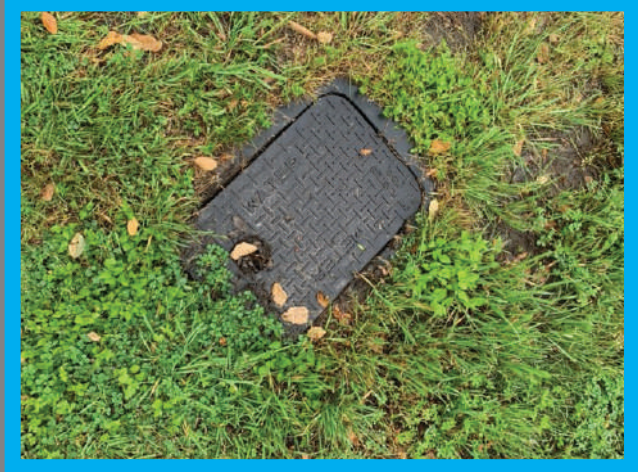
Figure A: meter box

This meter displays the word "leak" signifying that a problem has occurred. Additionally, the total amount of water used on this particular meter is, 108,939 gallons.